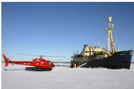
"Heli transfer to an Icebreaking meeting"