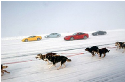
"Product launch – Ferrari and Maserati versus dog team on the frozen sea roads"

The chartered icebreaker, which is owned by Pite Havsbad, returns after approximately two hours.