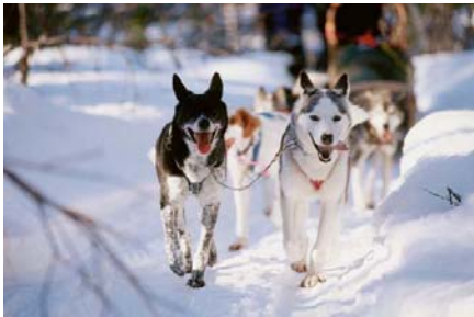
"Absolute silence - during a re-energizing transfer"