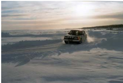
"Extraordinary school of ice driving"