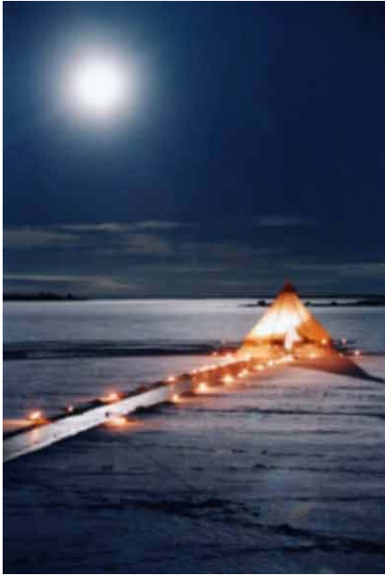
"Like a mirage in the white desert. Dinner on Ice, gala dinner with a difference"