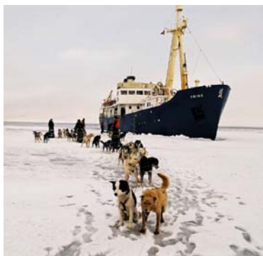
"Not a Polar expedition – but we provide just the right feeling"