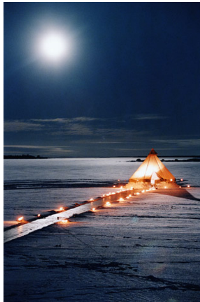
"Like a mirage in the white desert, seating 10-150p"

Welcome to a candle light dinner experience with a difference! A journey of the senses among totally natural material, based around the four elements. The warm fire beckons you straight out onto the ice of frozen sea. The crisp snow crunches underfoot, and your breath forms a cloud of tiny ice crystals in the clear, chilly winter air.