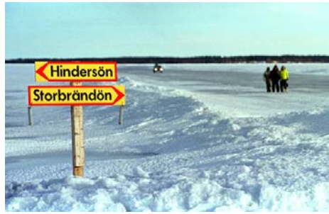
"60 km of ice roads ahead"

Imagine the pale midwinter light towards an ice blue horizon. Dry and cold snow whirl on the one-meter thick ice road, in some parts hundred meters wide. Easy and safe, yet with a feeling of that this shouldn't be possible.