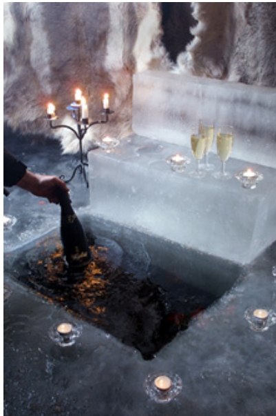
"Aperitif in Frozen Sea Champagne bar"