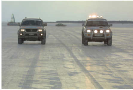
"Exploring the Frozen Sea"